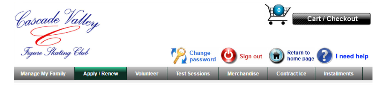
Step 2: Once in your EntryEeze account, click "Apply/Renew" button on the top menu bar.

Step 3: Select the appropriate the membership categories in the drop down list. Click on "View membership options" to see detailed descriptions of each membership type. If you have any questions, please email <a href="mailto:CascadeValleyFSC@yahoo.com">CascadeValleyFSC@yahoo.com</a> for help.